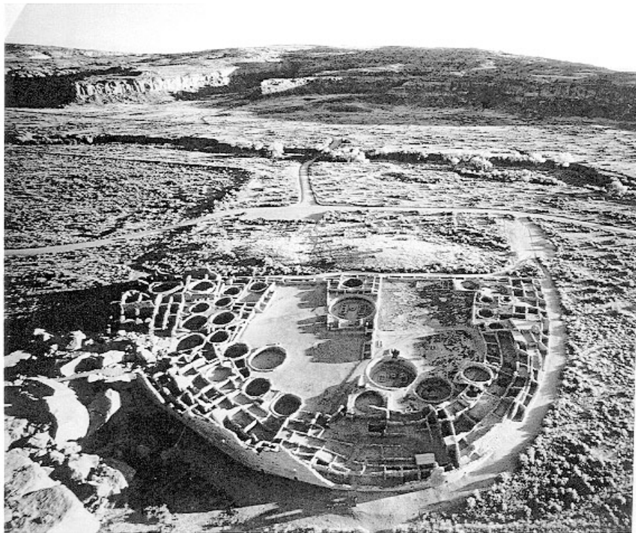
Aerial view of Pueblo Bonito from the north.